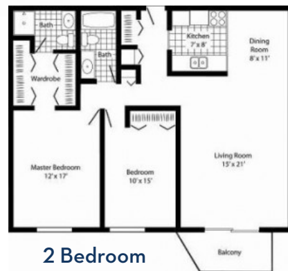
2 Bedroom 1,200 Sq. Ft.